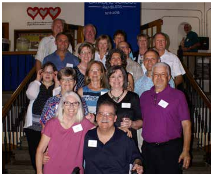
The Class of 1973 celebrates 45 Years!