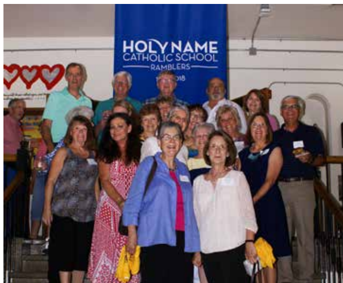
The Class of 1968 celebrates 50 years!